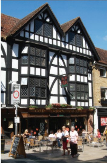
The God Begot House