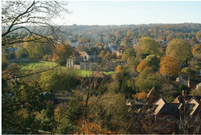
Wolvesey can be seen from St Giles' Hill.